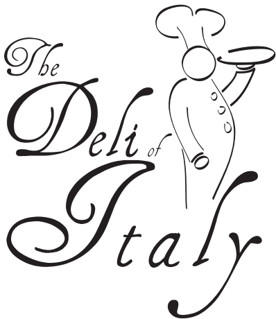
“Sam” with text